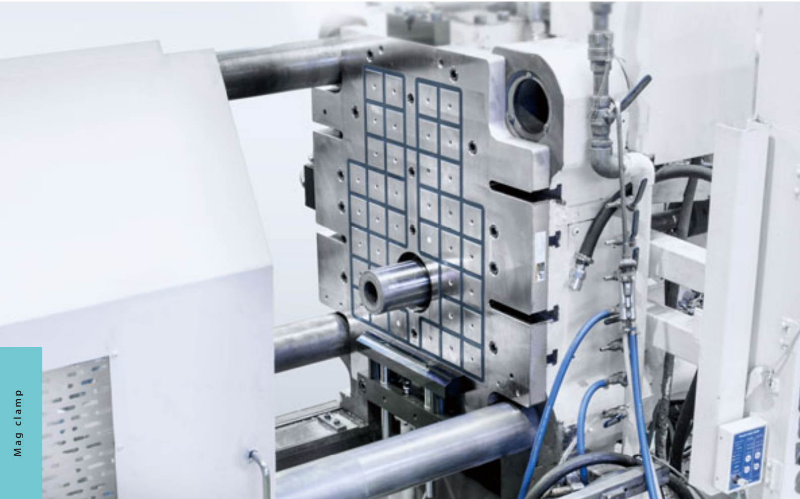
3,500kN (350ton) Die-casting machine Mag clamp & Die setter

As the mounting bolt and mounting space for automatic clamp are not required, the die-casting machine surface can be maximized.