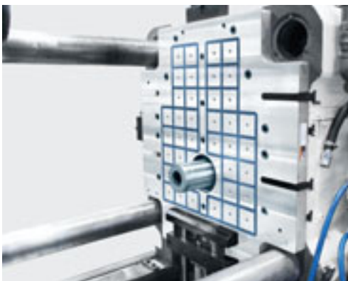
3,500kN (350ton) Die-casting machine Mag clamp fixed side