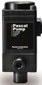
Pascal pump model X63